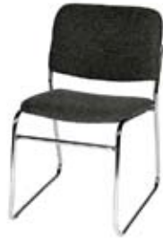
Upholstered Side Chair